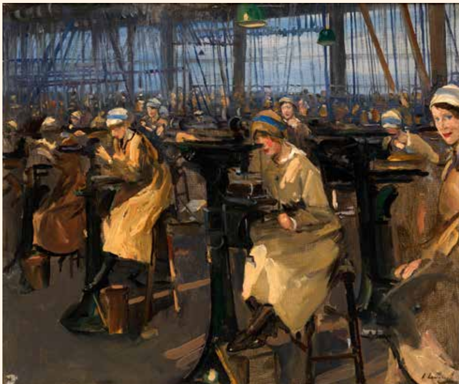
Women working in Newcastle factory, 1918 Sir John Lavery